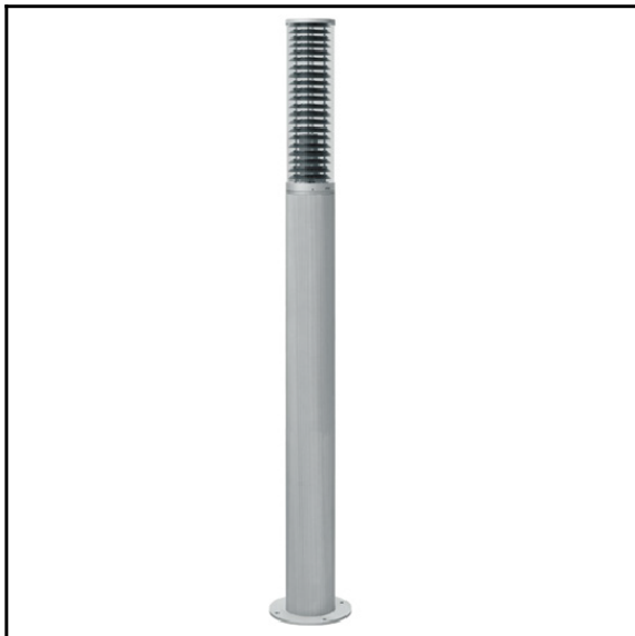
The photograph may not match the reference exactly. Please read the product description to identify the finish.